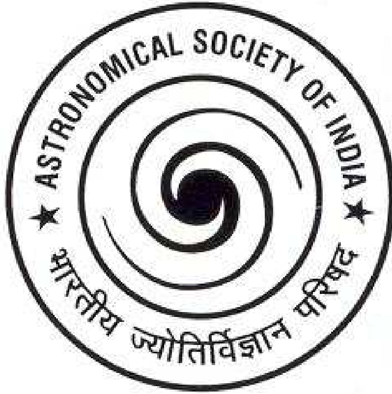
Figure 1. This is a simple figure, with one .eps file.

than the default \text{\LaTeX} ‘Computer Modern’ fonts. This package should be loaded with the varg option, i.e. using