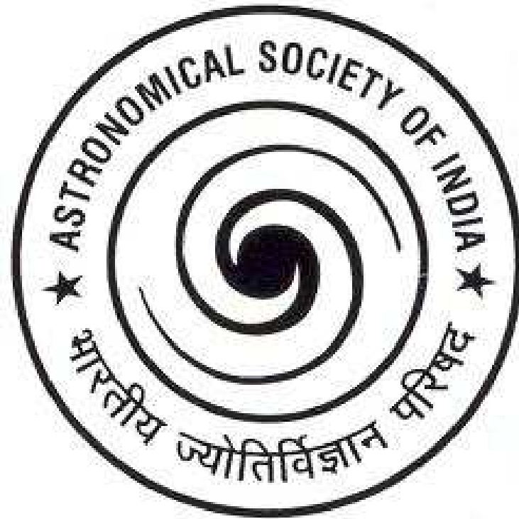
Figure 5. This figure illustrates how produce a sideways oriented figure.