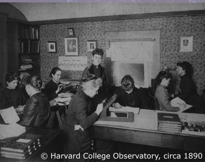
circa 1890